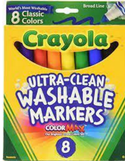
1 box Classic Markers