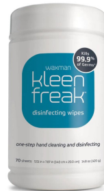
2- Disinfecting Wipes