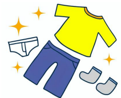
Extra Set of Clothes