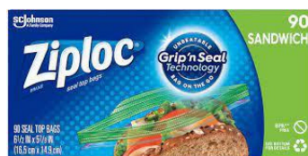
1 box- Ziploc Bags Boys: sandwich size Girls: gallon size