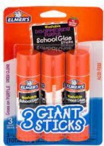
12 large Glue Sticks