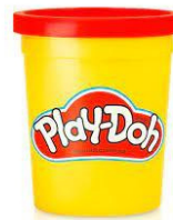
4 Containers Play-Doh