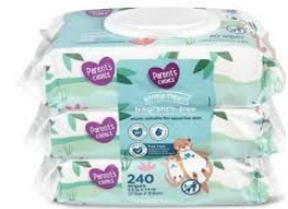
1 pack Baby Wipes