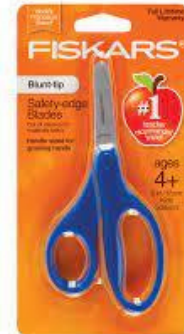
1 pair Fiskars Kid Scissors