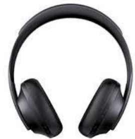
1 pair headphones no earbuds/no bluetooth