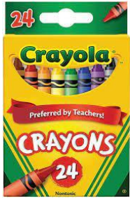
5 boxes of 24

1071 Jones Avenue - Ravenna, Ohio 44266 2023-2024 School Supply List