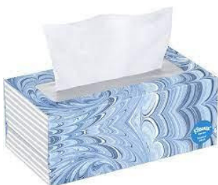
1 box of tissues