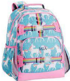
1 Backpack no wheels/standard size