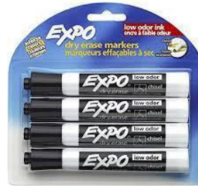
2 packs dry erase markers black/chisel tip