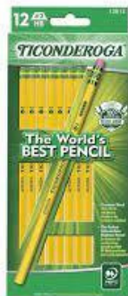
1 pack yellow #2 pencils